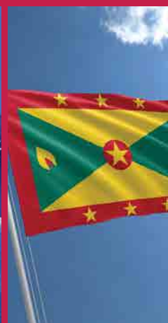
Grenada February 7