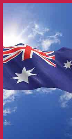
New Zealand February 6