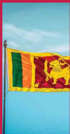
Sri Lanka February 4

Galaxy International School Uganda would like to wish families and friends from Sri Lanka, Grenada and New Zealand happy independence celebrations!