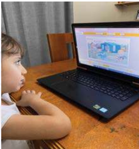
Safiye Nil Pisgin