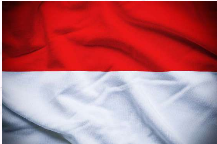
Monaco 19 November

Galaxy International School Uganda would like to congratulate and wish families and friends from Monaco and Lebanon a Happy Independence Day.