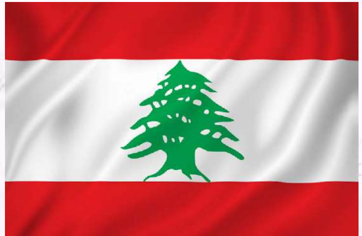
Lebanon 22 November